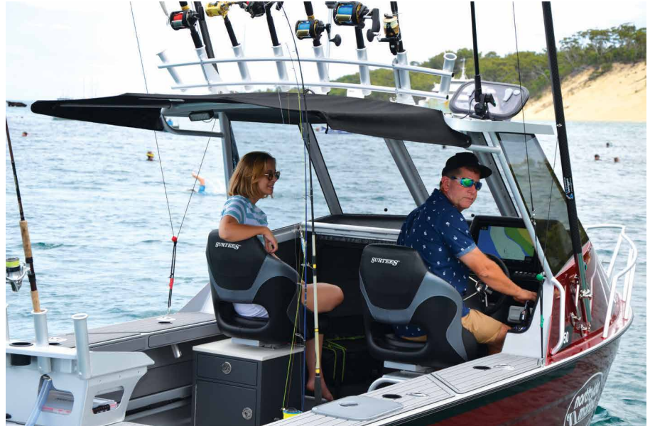
CLOCKWISE FROM ABOVE The Surtees has space for six; Rod holders galore; It's got all the features you need for fishing but can also be tricked up as a dive or family boat; The Helm Master EX seamlessly auto navigated us out of the creek

In 4-5kt of tide combined with wind, the standard default torque setting of two for Fish-Point isn't enough to hold you on the spot, but a few simple taps on the joystick changes the torque setting to suit. Now obviously the motor livens up if you have set on high torque, but it did a bloody good job at holding the Surtees within 2-5m of the spot. This is a definitely a function I would constantly use and, if conditions were too harsh on transom back-ups, you then have a plethora of other options available to suit. The Drift-Point function allows the bow to be pointed in a set direction whilst naturally drifting, or you can use the Drift-Point Track function which does the same, but on a set track of waypoints so you don't miss the hot spots on the reef. Again, these functions can all be set at the suitable torque to suit conditions.