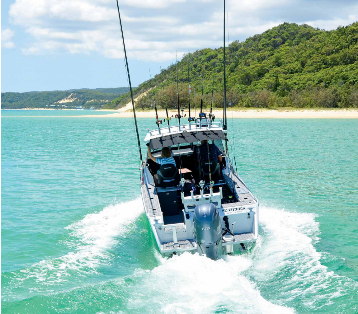
TOP TO BOTTOM It handled chop and glassy conditions equally as well; There wasn't much biting on review day (once again)

The cab is open plan with a simple zipped canvas to close it off, along with a large vent hatch to access the anchor well. The cab has decent sized side pockets, is plush lined, has decent under-seat storage and is surprisingly spacious and comfortable for the odd overnighter or midday nap when you are fished out.