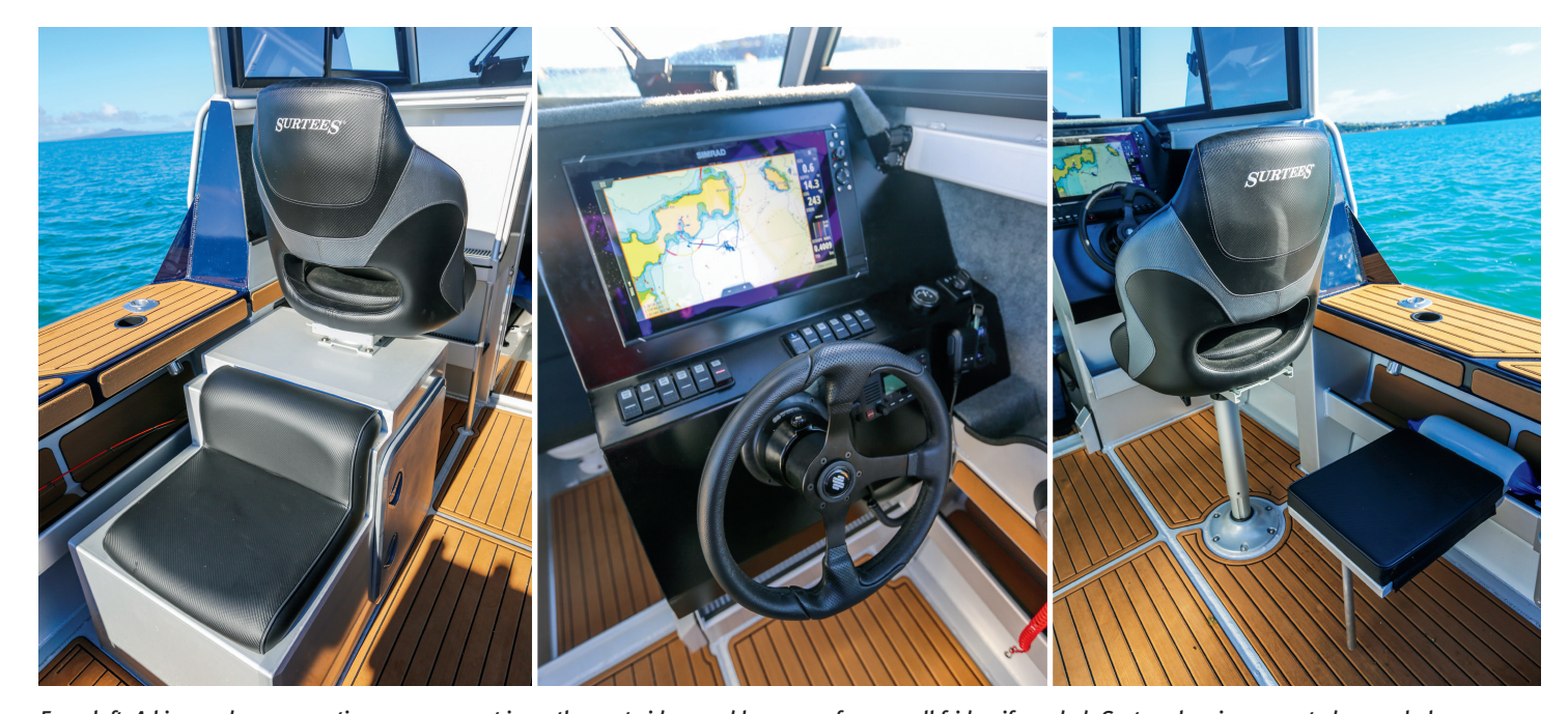
From left: A king and queen seating arrangement is on the port side – and has room for a small fridge if needed; Surtees has incorporated a new helm station that will take up to 16" screens, flush-mounted; Practical, comfortable and stylish – the helm seat with the removable passenger seat behind it.

The cabin locks with a substantial sliding door and is fully carpeted. A large hatch aids the flow of air while at anchor, as well as access to the anchoring