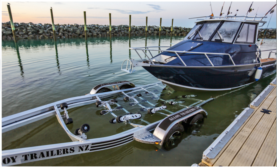
A fully-rollered Alloy Trailers Ltd trailer get the Surtees to where it needs to be.

Boat supplied by Fishing Boats NZ, North Shore, Auckland.