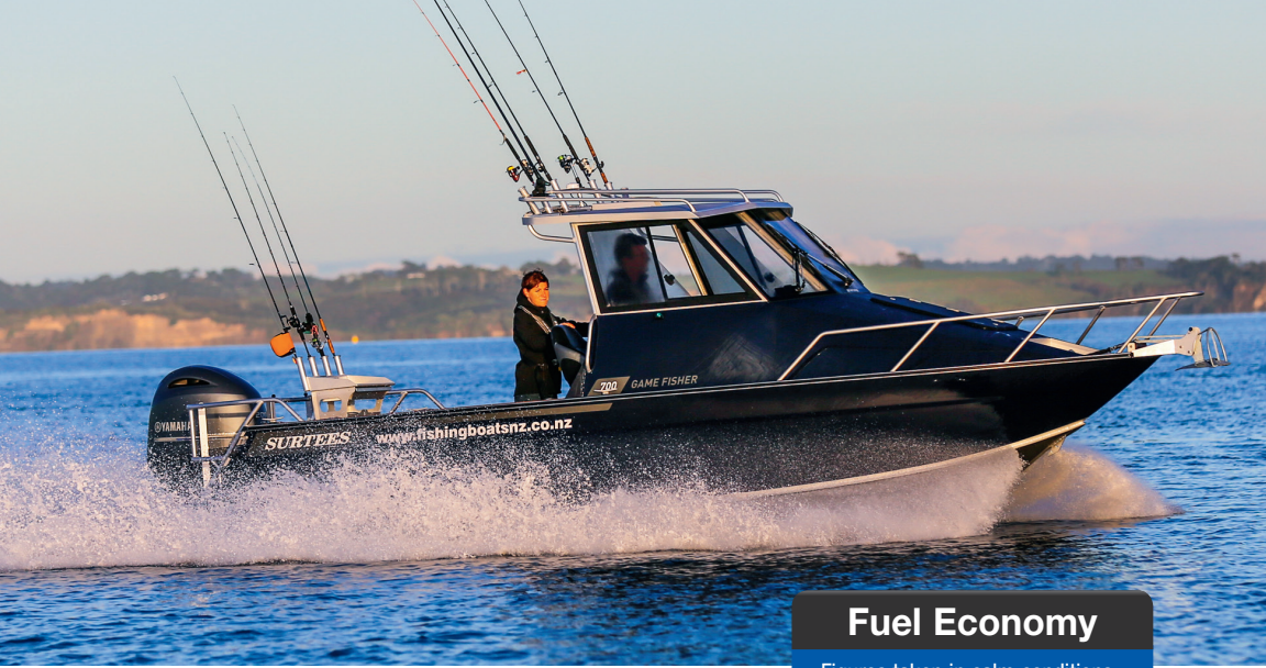
Left: Fishing Boats NZ's apprentice technician Brooke Browne showed us how it was done, catching dinner just a few minutes from the ramp.

mounted with the transducer fitted through-hull. A row of rocker switches was placed on their own 'ledge' running the width of the helm station – handily placed and easy to see and operate. There was plenty of space for the Lone Star 6X2 drum winch control and VHF. A stereo was not fitted, but there was no shortage of space if needed, along with space for an autopilot. The trim tabs were operated with a controller conveniently placed beside the throttle.