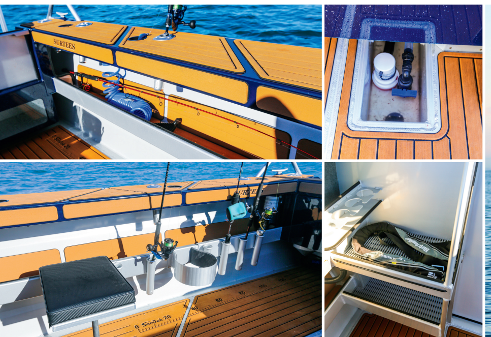
Clockwise from top: Shelving that runs the length of the cockpit makes great storage for rods, gaffs and the like; A centrally located sump houses the bilge pump; Provision has been made for a gas cooker in what is described as a 'mini-galley' located in front of the passenger seat; A feature of the boat is the Surtees clipon rod and dive bottle holders and seat.

Owners wanting a seven-metre Surtees have a choice as to cabin length – it can be made either 1.3 or 1.8 metres long, depending on your priorities – an owner predominantly wanting a day fisher will go for the shorter cabin and others wanting overnighting options will order the longer version. The choice is either cockpit or cabin space.