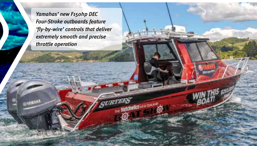
Yamaha's new F150hp DEC Four-Stroke outboards feature 'fly-by-wire' controls that deliver extremely smooth and precise throttle operation

The cockpit is large with plenty of fishing room and flat faces for anglers to lean against. Cockpit side-shelves will take poles and rods, and the wash-down hose. Isolation switches and fuel filters are housed in transom lockers, along with a bit of protected storage room and the battery