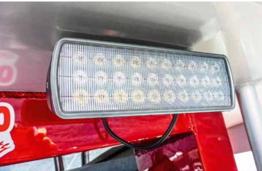
A comprehensive Hella lighting system includes colour Sea Hawk-XL LED work lamps to light the cockpit.

system already mentioned. The transom wall also features a step-through with a drop-in door, and over the back is the boarding platform and boarding ladder.