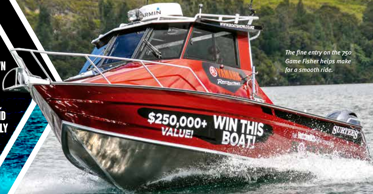
The fine entry on the 750 Game Fisher helps make for a smooth ride.

WITH A FINE ENTRY, 20-DEGREE DEADRISE, AND THE WELL-KNOWN SELF-FLOODING BALLAST TANK ALONG THE KEEL, STABLE, SOFT AND DRY ARE THE ONLY THREE WORDS REQUIRED.