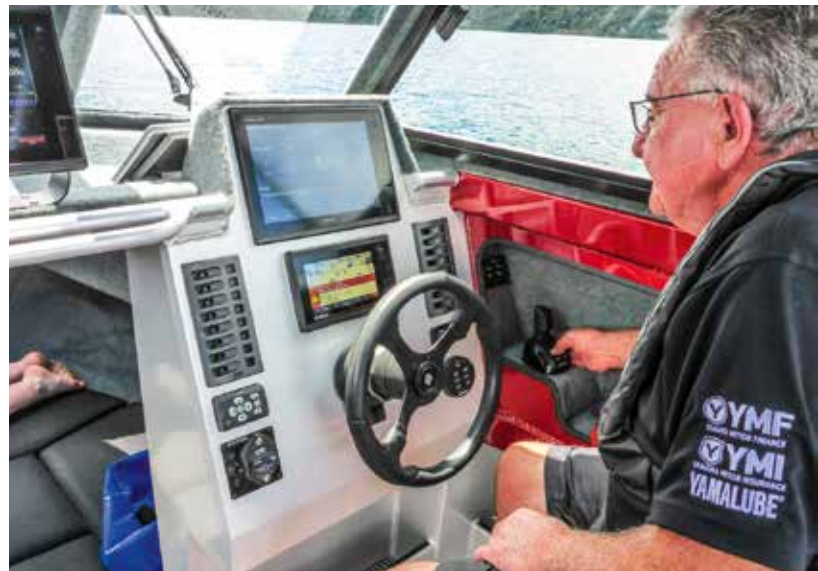
From left: The transom step-through features a live bait tank; The rig is fitted with comfortable king and queen seating, there is plenty of stowage around the passenger seat; The fly-by-wire steering and Helm Master control system make the rig an absolute pleasure to drive.

reverse, laterally left or right, on a diagonal, or to pivot it in place through 360 degrees (yes, it will turn in its own length) – great for docking and close-quarters work.