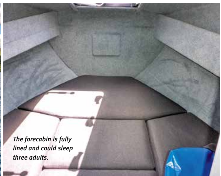
The forecabin is fully lined and could sleep three adults.