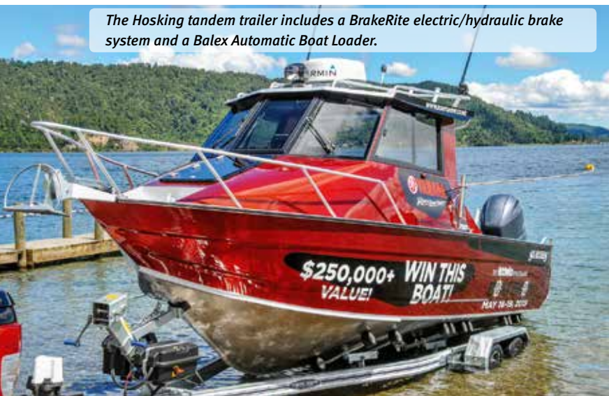
The Hosking tandem trailer includes a BrakeRite electric/hydraulic brake system and a Balex Automatic Boat Loader.

This beautifully-finished boat is well suited for fishing and diving