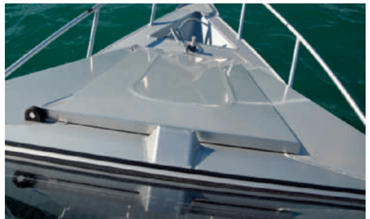
A LARGE HATCH MAKES THINGS A LOT EASIER.