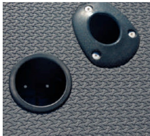
THE ROD HOLDERS AND SINKER CUPS/DRINK HOLDERS ARE WELL PLACED ON THE WIDE GUNWALES.