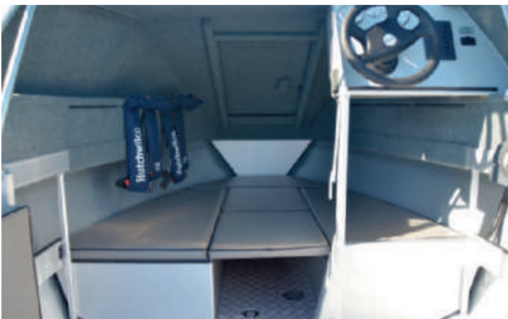
THE CABIN ISN'T HUGE BUT IS WELL THOUGHT OUT AND COMFORTABLE.