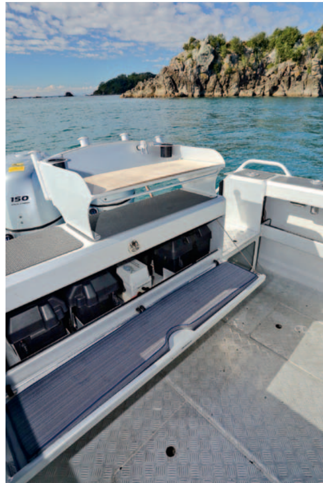
Stowage abounds throughout the Surtees 8.5 Game Fisher; batteries are well-protected in lockers above the cockpit sole.