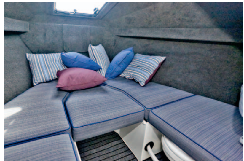
The Surtees 8.5 Game Fisher has a compact galley, good dining and comfortable accommodation with plumbed head, for'ard, and plenty of stowage. The helmstation is fully spec'd for a boat capable of exploring extensive fishing grounds.

At rest the boat is nice and stable, its flooding keel chamber quickly fills with 600 litres of water. Unlike smaller models in the Surtees range, the ballast gate on the 8.5 Game Fisher opens and closes hydraulically rather than mechanically.