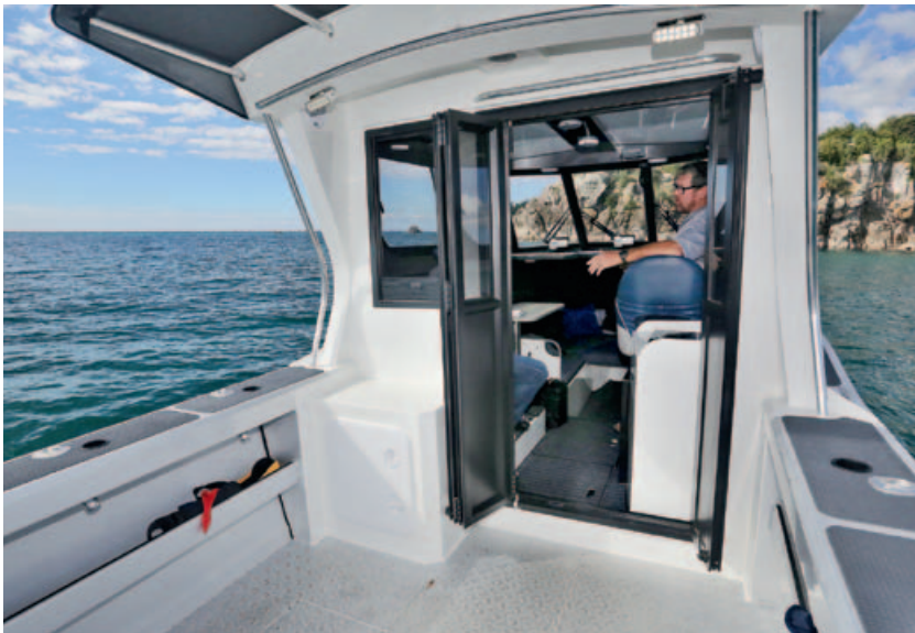
The fishing-dedicated cockpit has high coamings, washable surfaces and good shelter.