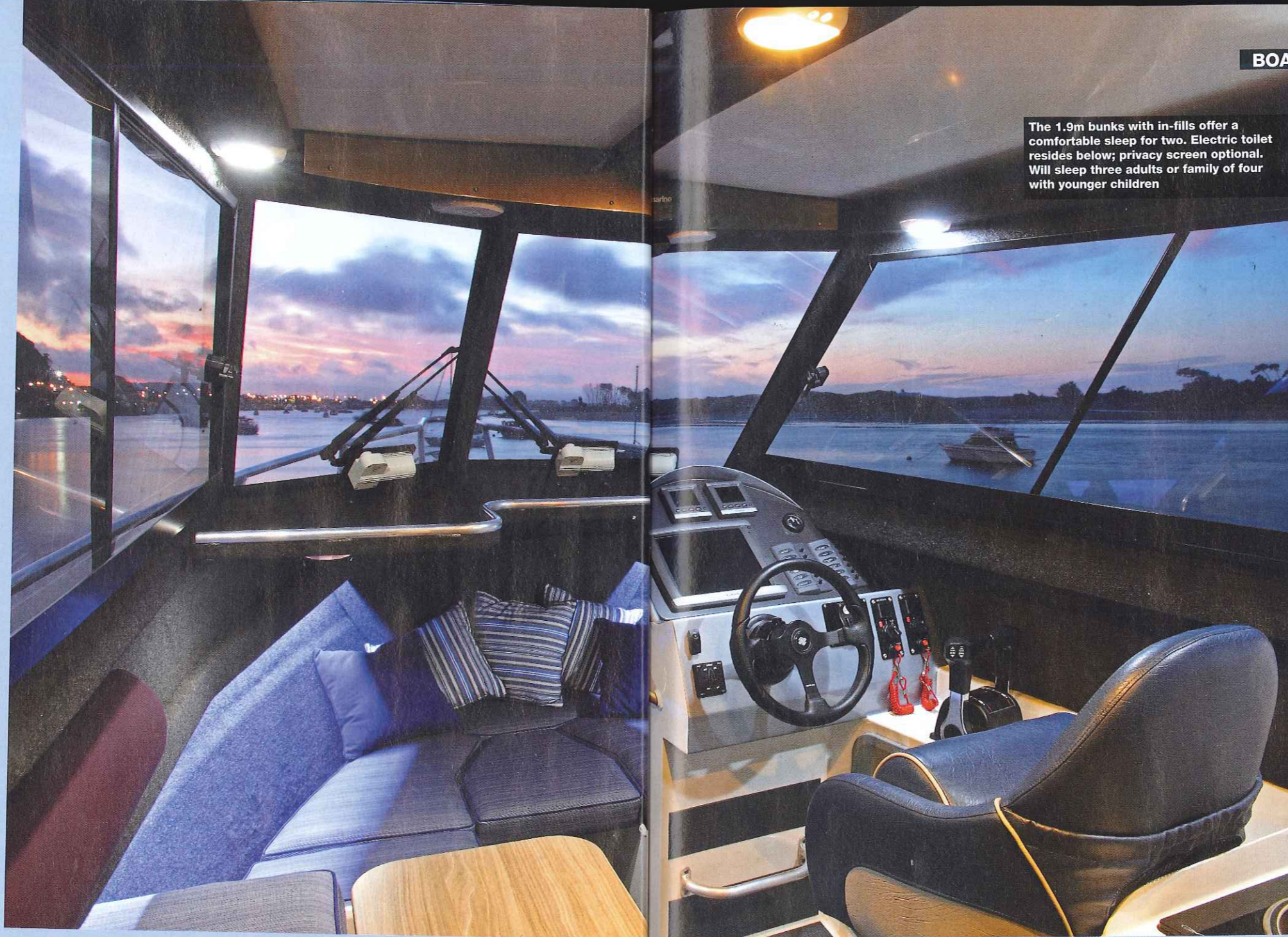
The 1.9m bunks with in-fills offer a comfortable sleep for two. Electric toilet resides below; privacy screen optional. Will sleep three adults or family of four with younger children

One user-friendly upgrade is the hydraulic ballast flap, which is easily operated via a switch on the dash. Anchoring can also be