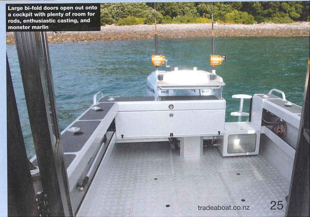
Large bi-fold doors open out onto a cockpit with plenty of room for rods, enthusiastic casting, and monster marlin