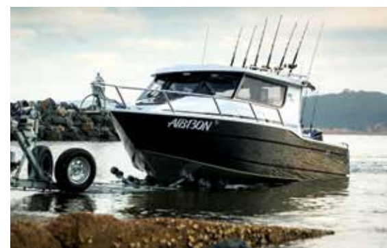
CLOCKWISE FROM MAIN Performance and stability are hallmarks of every Surtees; The next generation of New Zealand fishos; Surtees is a part of the NZ fishing culture; A Surtees owner's proudest catch.

Surtees boats deliver the perfect balance of cabin and fishing space packed to the gunnels with Surtees SiQ™ technology and features. Over 90% of the boats are treated with Nyalic, a paint-like substance that protects the aluminium hulls from harsh environments that cause corrosion, oxidation, stains and pitting, or alternatively there is a full range of optional paint finishes.