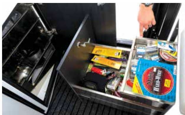
CLOCKWISE FROM TOP Australia's Greatest Boat 2017 winner the 700 Game Fisher during testing in Hervey Bay; The 495 Workmate is a Trade-a-Boat favourite; Functional storage for days; On board the rugged 750 Game Fisher off Tasmania