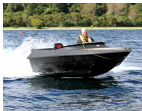
ABOVE Why can't all tests be this exciting? RIGHT Surtees' Game Fisher series combines purposeful design with exciting performance